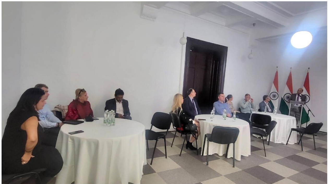
Romanian companies actively participated and explored opportunities with Indian firms.